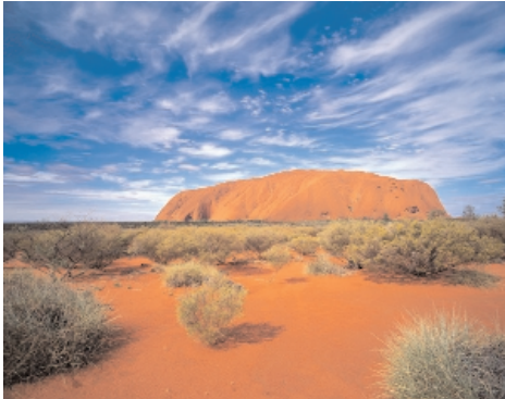
Uluru National Park in Australia's Northern Territory is famous for this site: Ayers Rock.