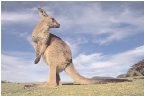
The red kangaroo is the most common species. It lives in central Australia, in arid or semi-arid regions, and can grow to 1.4 meters in height (4.6 feet) and weigh as much as 70 kilograms (154 lbs.). Its powerful back paws move it along at speeds of up to 65 km/hour (40 mph) and it can leap up to 9 meters (29 feet) in a single bound.

In 1770, a three-mast sailing vessel arrived off the mountainous coast of an unknown land. It was the Endeavour, piloted by Captain Cook. The southeastern tip of the new continent came into view on April 19, 1770. Its existence had been suspected by the Ancients, who had referred to it as Terra australis incognita: Unknown Southern Land.